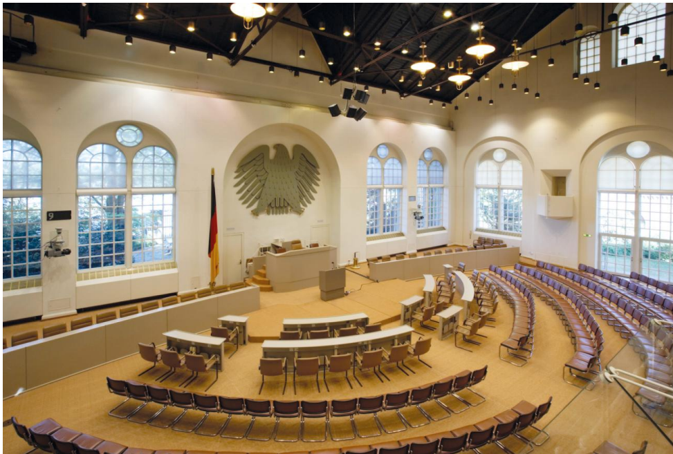
Former Bundestag meeting room.