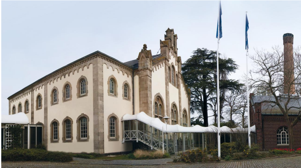
View of the building.

Beyss Architekten GmbH Haydnstraße 36 53115 Bonn