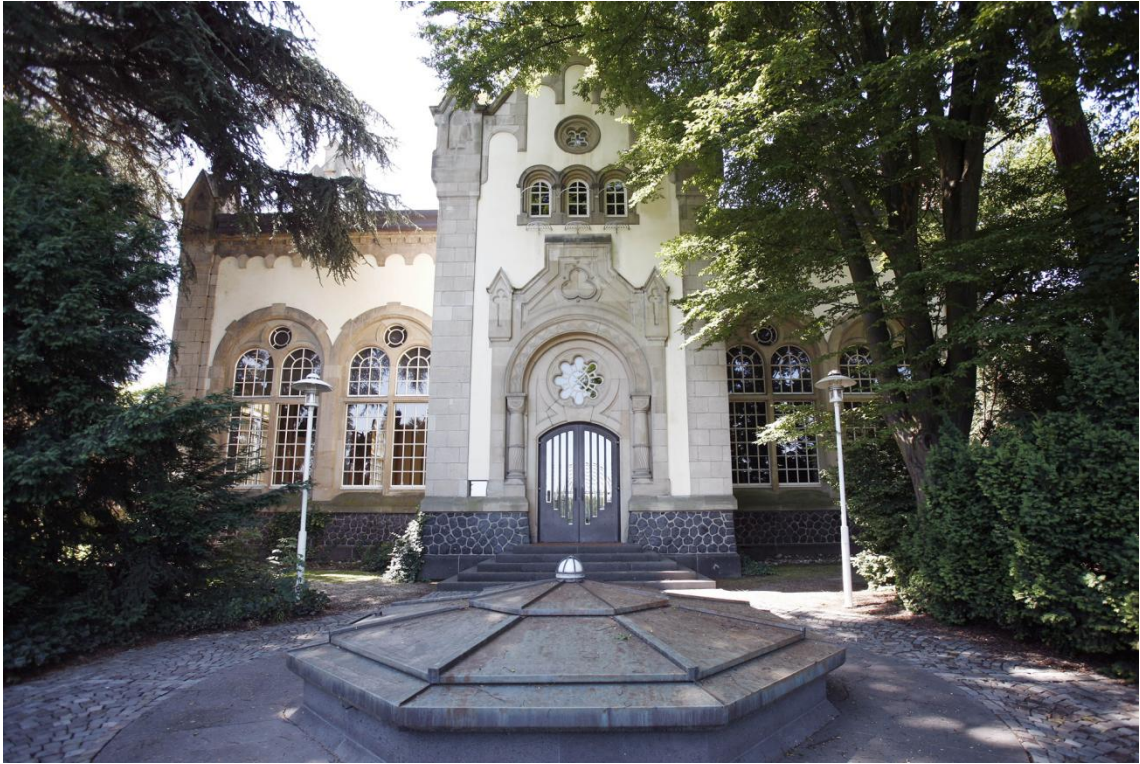
The listed waterworks and pump house ensemble served as the seat of the German Bundestag from 1986 to 1992