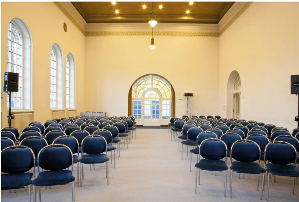
Event room pump house.