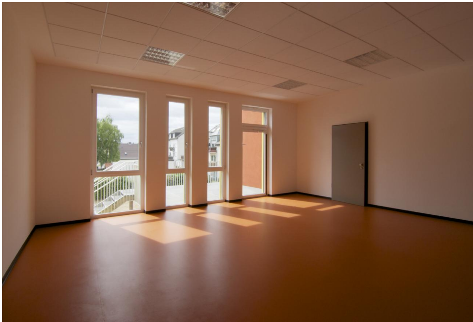
Interior view with floor-to-ceiling window front