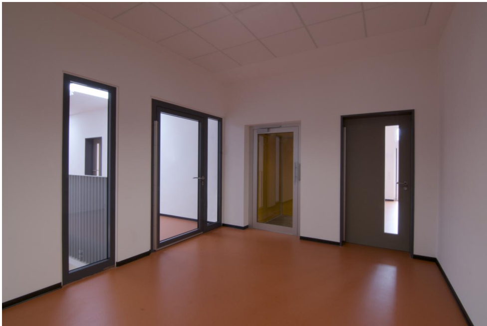
hallway area upstairs with a view of the elevator