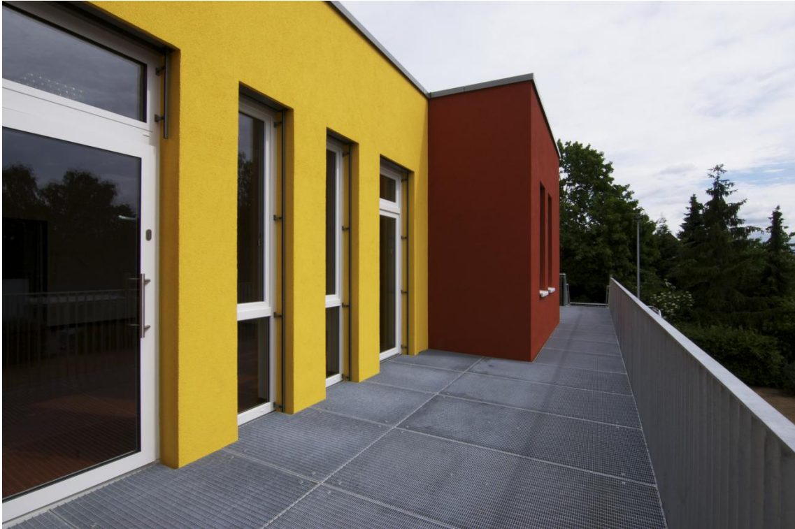
external access corridor on the upper floor