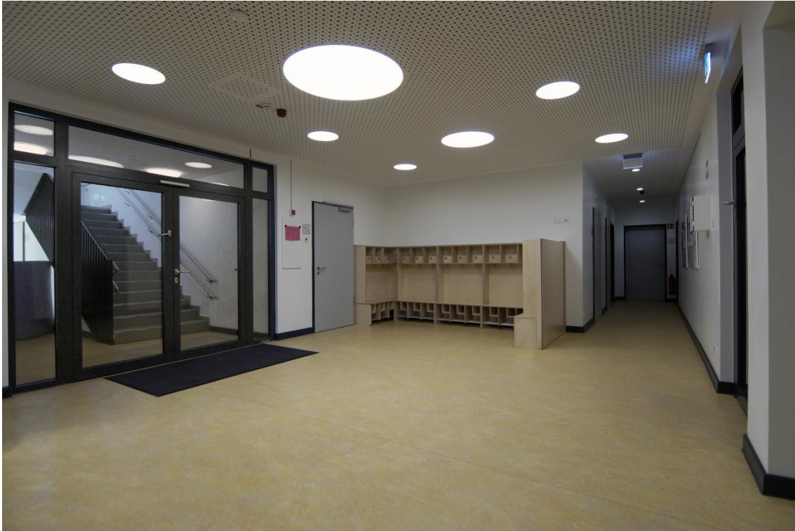
entrance area with circular ceiling lamps and cloakrooms for the children

A centrally arranged, two-story foyer is a meeting point for children and parents. This is followed by the management office and a therapy room on the ground floor. On the first floor, the foyer opens up a multi-purpose room for all groups. A separate access via the stairwell enables the organization of external events without affecting the ongoing kindergarten operation.