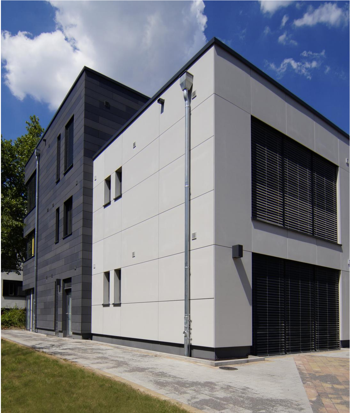
two-storey building with three-storey part as a corner building, view from the outside play area