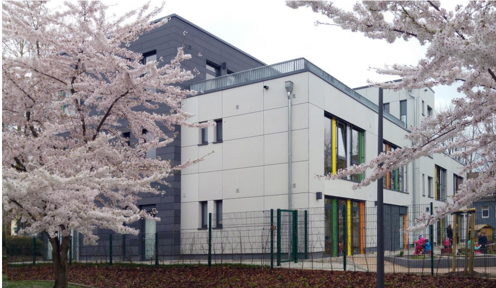
'Am Rathaus' day care center, Solingen. View with play area.