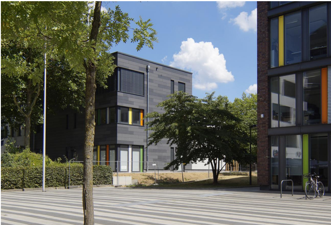
view of the building