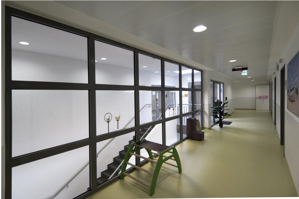
station corridor on the 1st floor and stairs to the ground floor