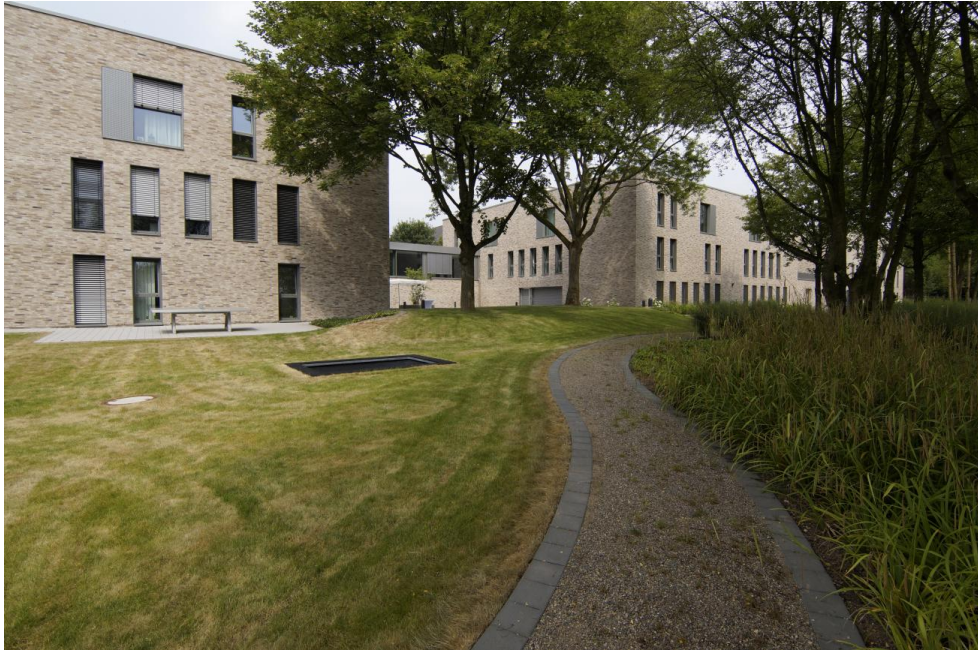
square cubes and differentiated open spaces are lined up