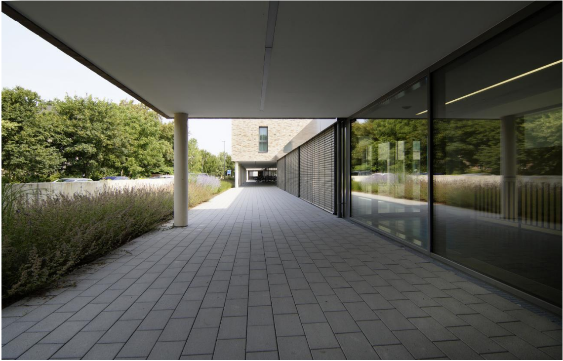
entrance, paediatric and youth psychiatry department