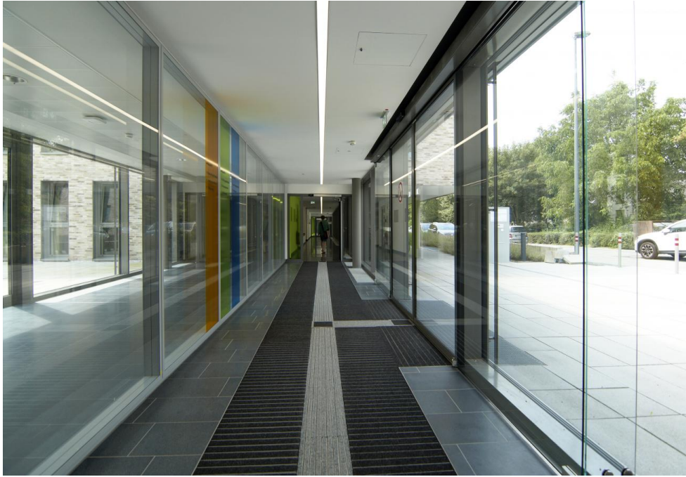
looking down the hallway between glass walls