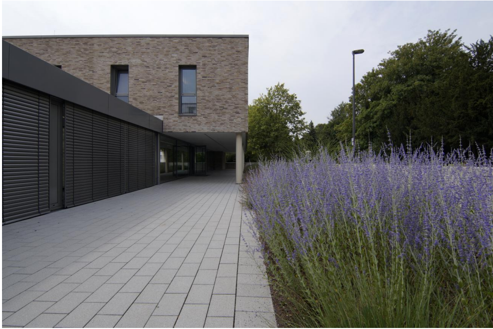
view along the outer facade at 'Neuenhofer Weg'