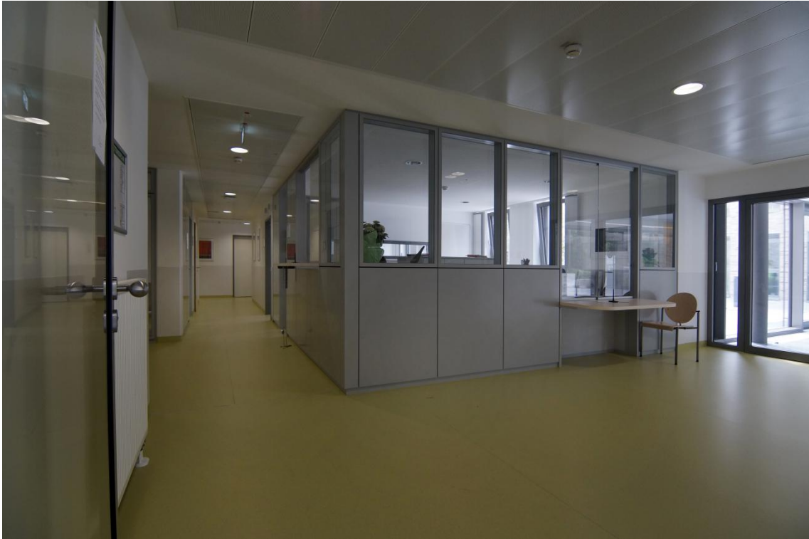
corridor with reception area of ??the ambulance

The ambulance and therapy rooms and a multi-purpose room with a spacious terrace are arranged on the ground floor. The clearly readable, quieter three stations lie above it. Easily findable stairs and lifts open up all areas barrier-free. The externally protected care areas with patient rooms, treatment and office rooms as well as openly designed communal living areas are organized around homely courtyards.