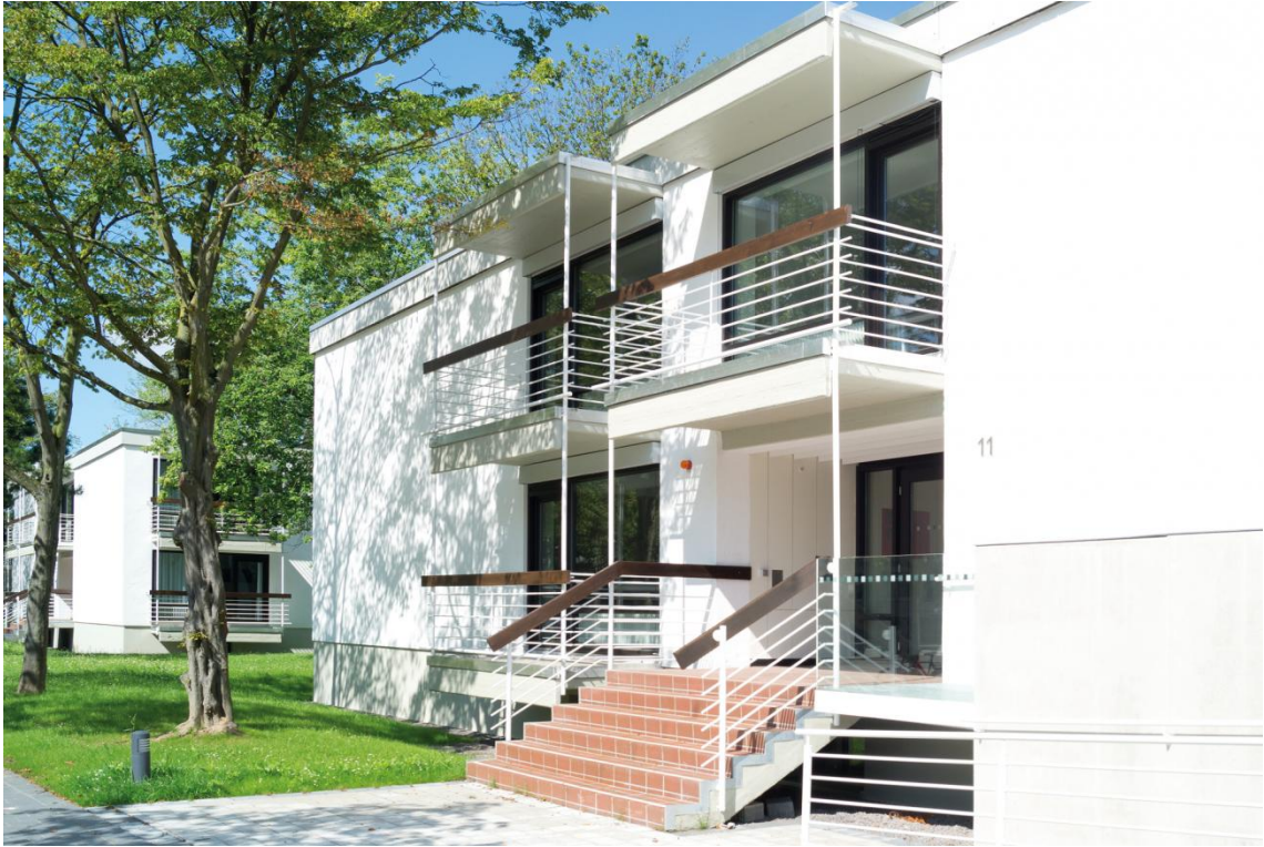
exterior view, office building ('Haus 11')