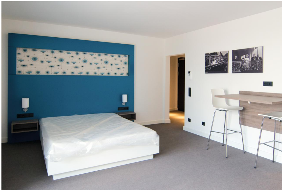
inside view, 'Boarding-House' ('Haus 7 + 9')

Beyss Architekten GmbH Haydnstraße 36 53115 Bonn