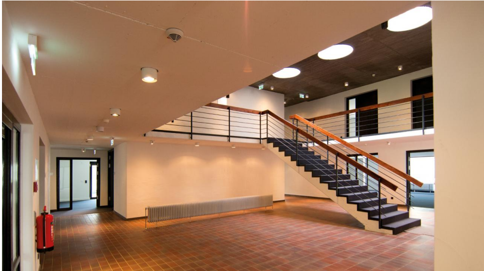
hall of the office building ('Haus 11')