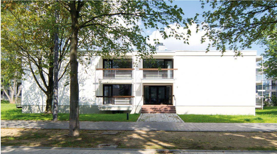
exterior view, office building ('Haus 11')