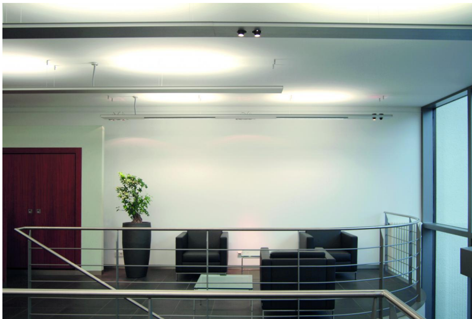
foyer of the tenant

Beyss Architekten GmbH Haydnstraße 36 53115 Bonn