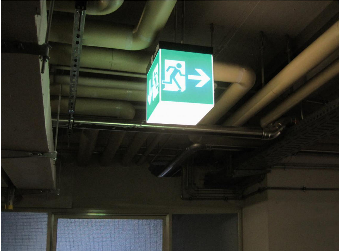
escape routes signage

Beyss Architekten GmbH Haydnstraße 36 53115 Bonn