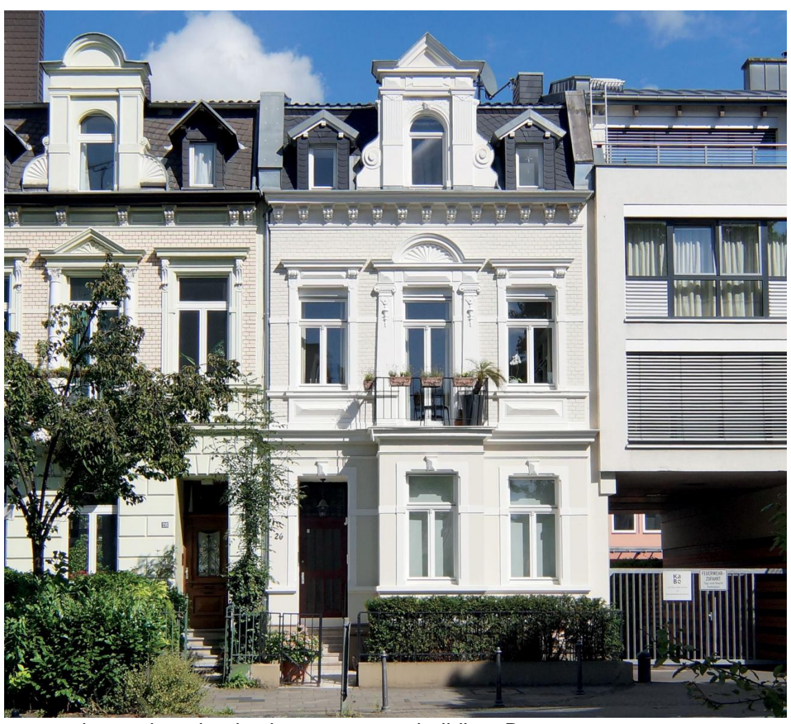
conversion and modernisation, apartment building, Bonn