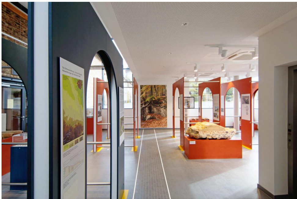
'Römerkanal Informationszentrum', Lichtlinien zeichnen den Verlauf der alten Stadtmauer nach

In close coordination with the preservation of historical monuments and those involved on the part of the city and the friends of the Roman Canal, a cautiously designed, massive cube is created against the backdrop of the Himmeroder Hof, which is separated from it by a glass connecting structure. The 'glass joint' is at the same time a sensitive connection between 'new' and 'old'. The massive edge of the building of the new building takes up the historical course of the city wall and thus fits into the cityscape.