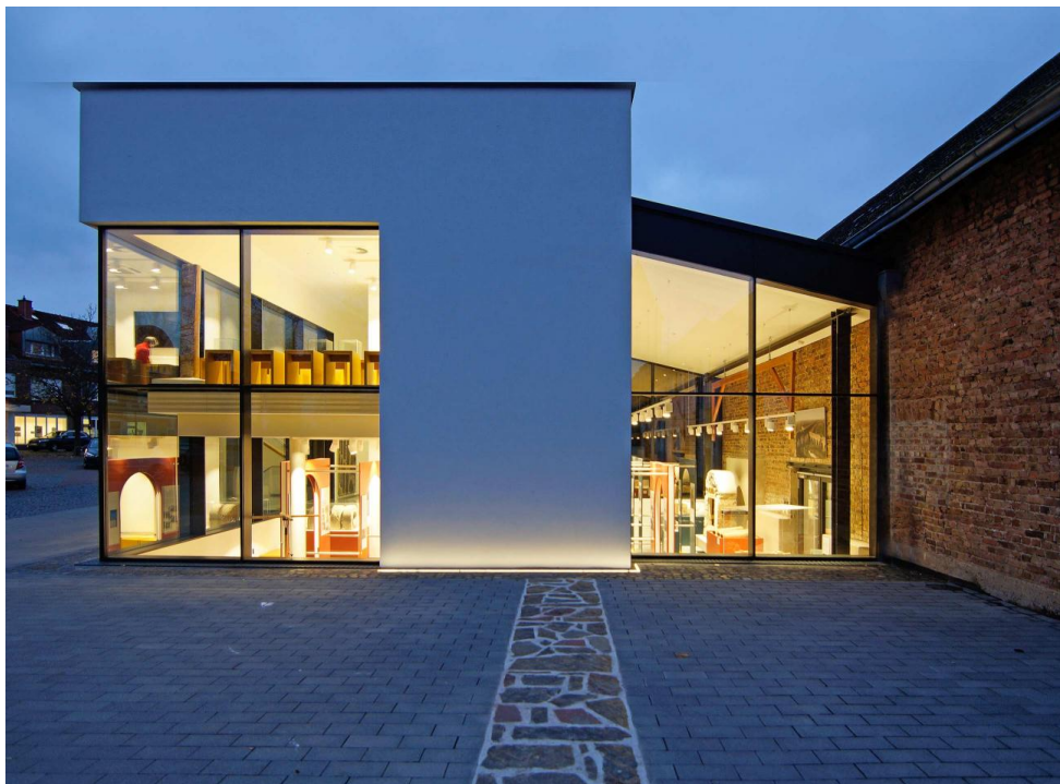
'Römerkanal Informationszentrum', Nachtaufnahme