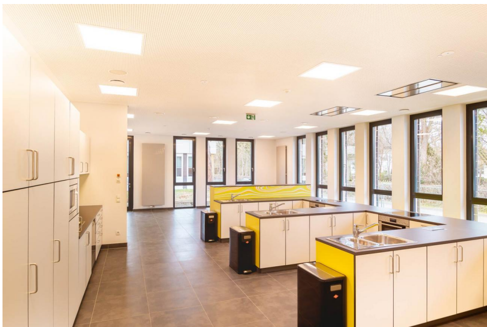
Die neue Lehrküche