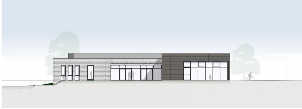
view, entrance side of the mensa

The class and specialist rooms for grades 5 - 8, including all adjoining rooms, will be housed in the existing school building. In addition, an extension with four classrooms is being built to extend the existing southern extension to the school. The facade design - with continuous window strips and skylights - is based on the extension built in 2008.