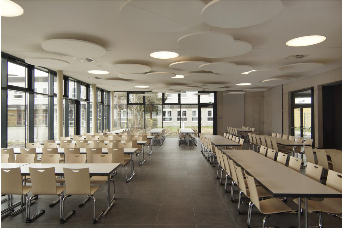
mensa, dining room