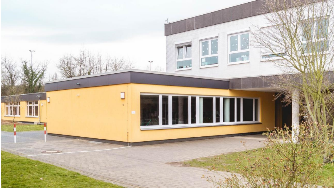
Erweiterungsbau aus 2008 für Klassen- und Fachräume

Zur Projektseite des weiteren Standortes am Dederichsgraben