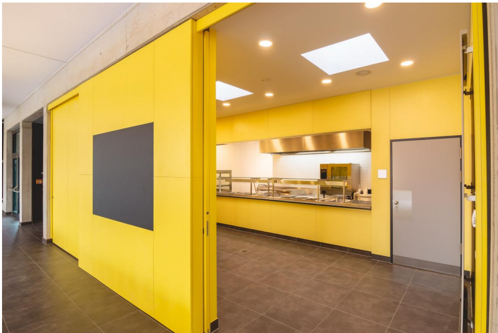
Ausgabeküche der Mensa