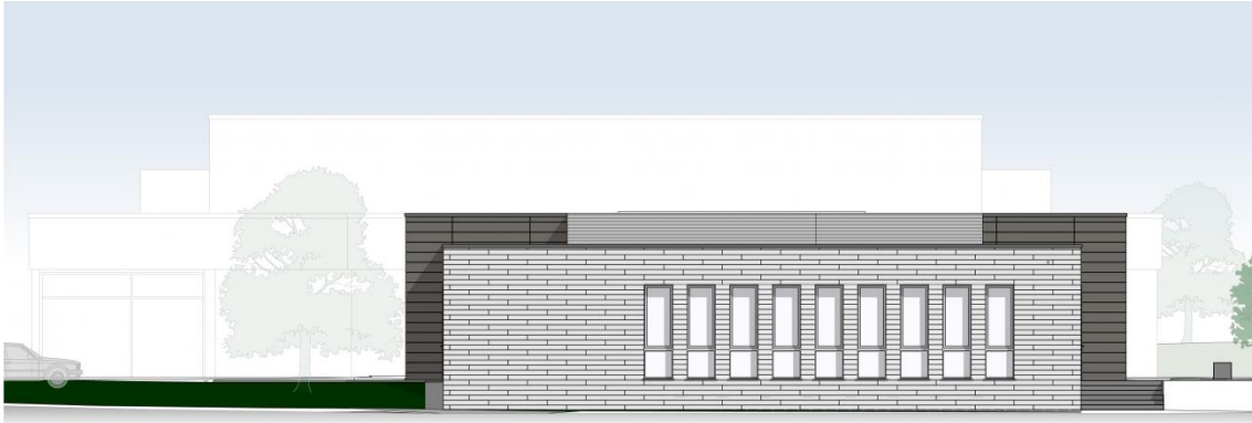
north view, mensa

The building height of the mensa takes up the height of the city hall opposite the school forecourt. The facade is generously glazed towards the square and is clad with rear-ventilated, large-format, anthracite-colored panels made of glass fiber concrete. Vertical, floor-to-ceiling individual windows characterize the adjoining facades.