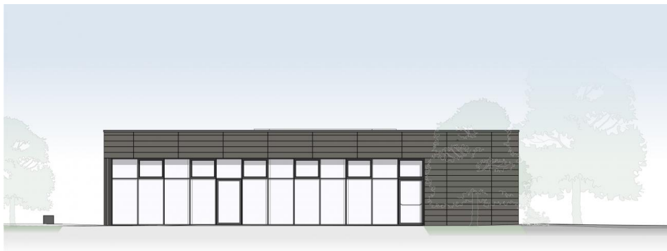
mensa view of the school forecourt