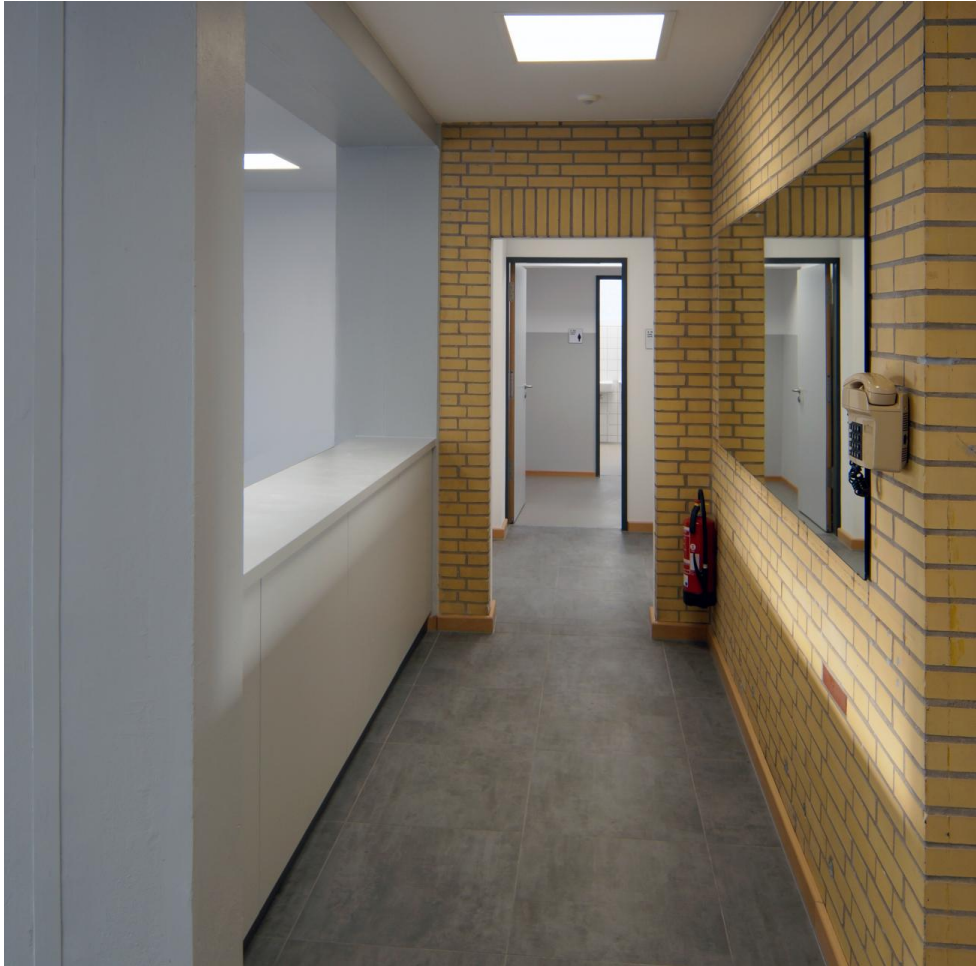
sports and multi-purpose hall Duisdorf, access to changing room and shower room