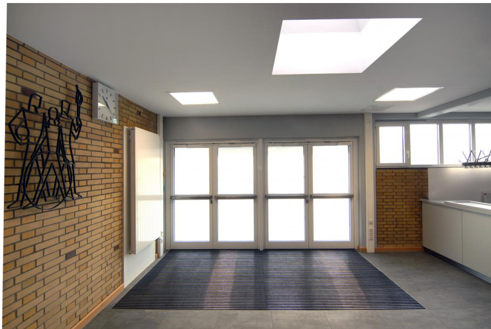
sports and multi-purpose hall Duisdorf, entrance