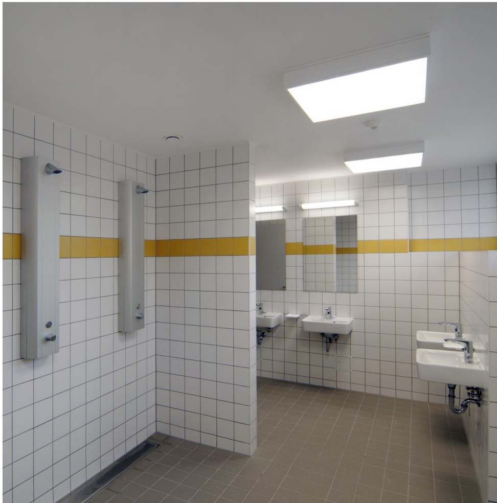
sports and multi-purpose hall Duisdorf, shower room

Beyss Architekten GmbH Haydnstraße 36 53115 Bonn