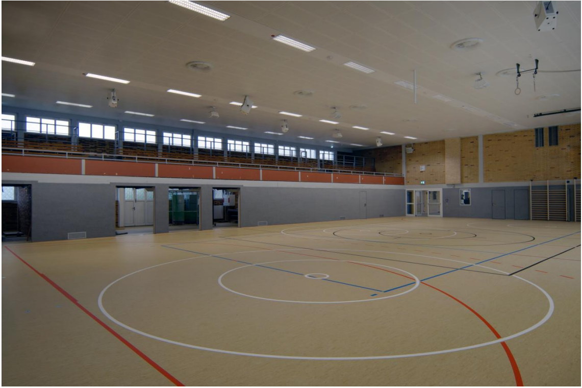
sports and multipurpose hall Duisdorf