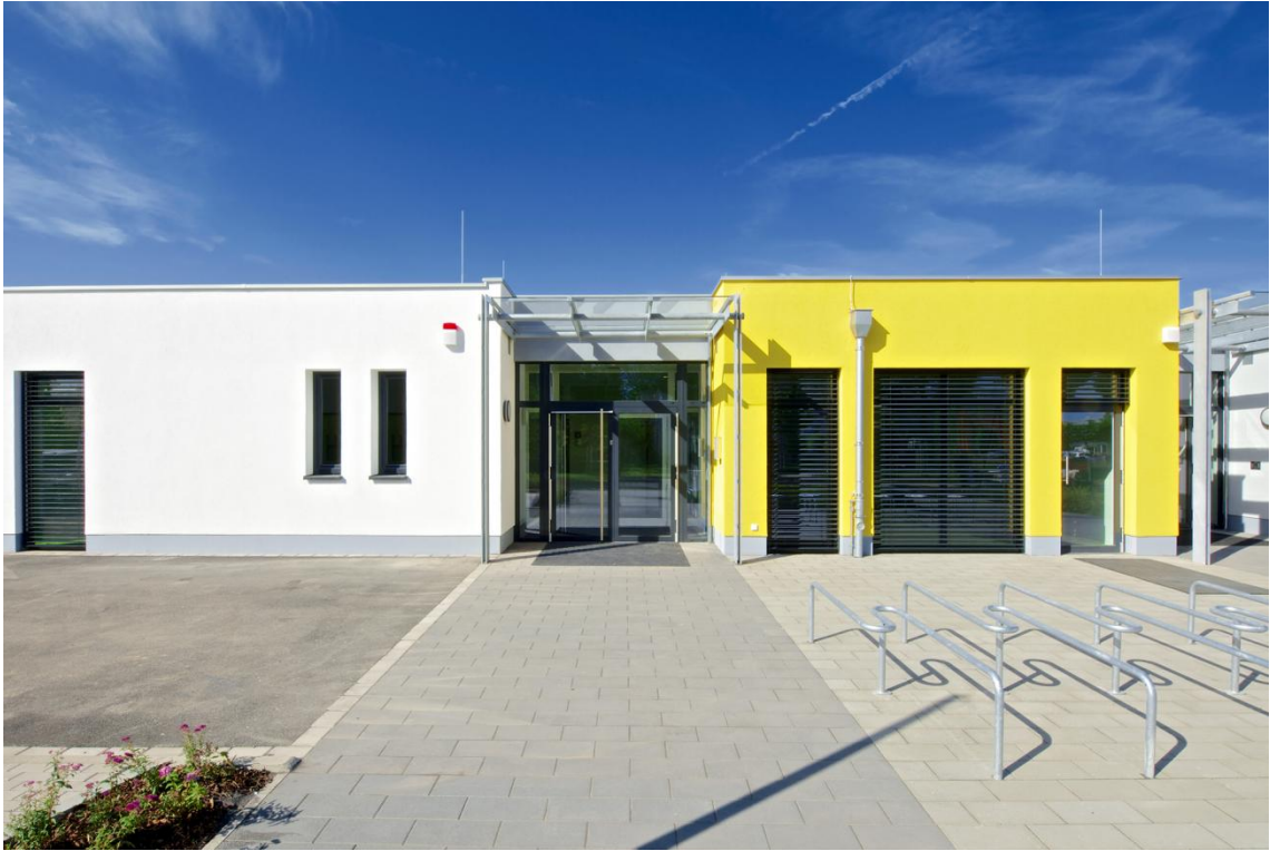
exterior view of the building, entrance