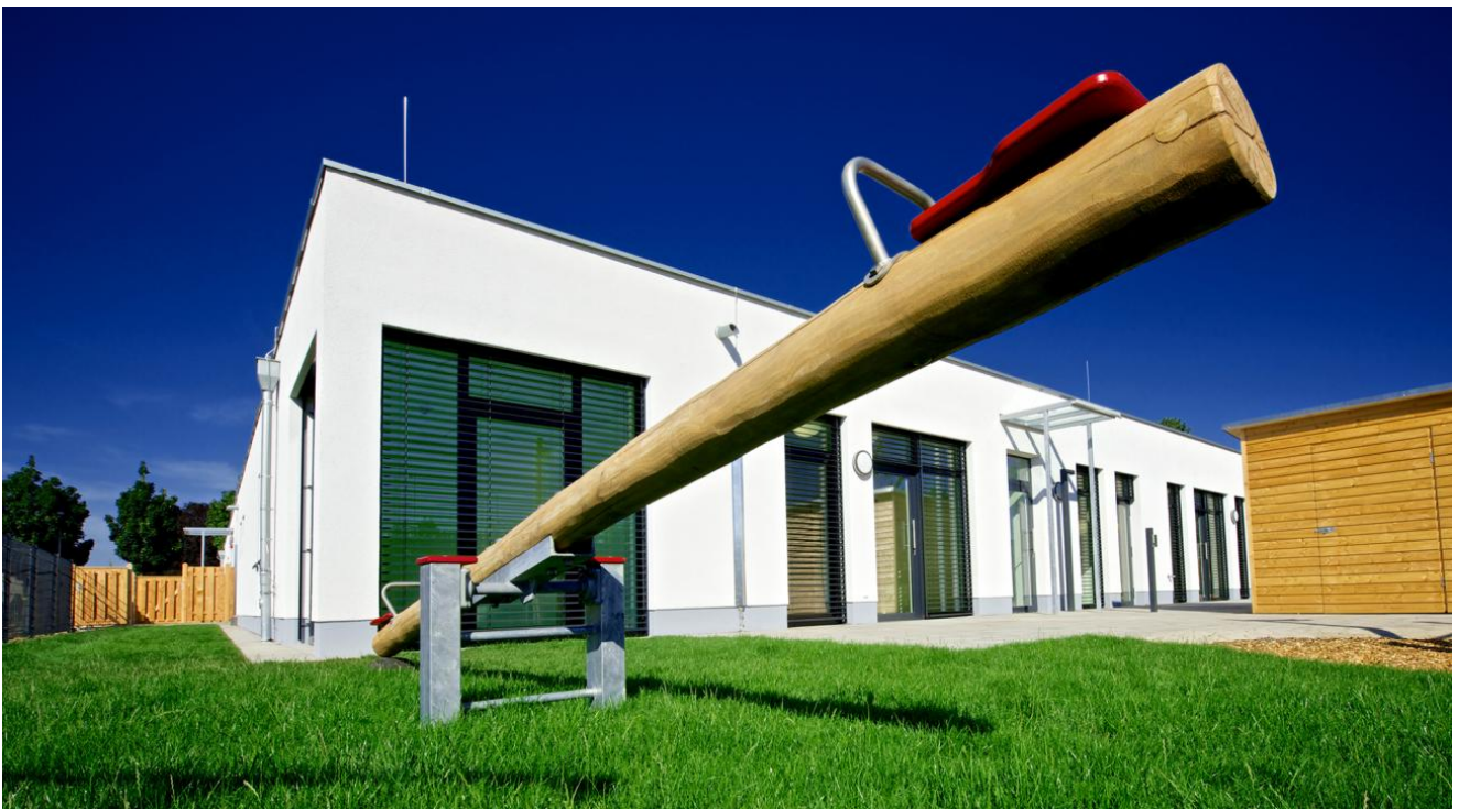
exterior view of the building