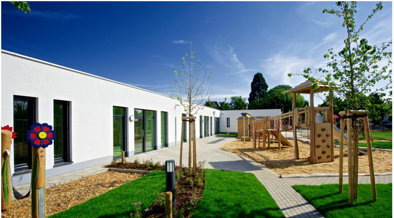
exterior view of the building

The building is constructed in a timber frame construction with a slightly sloping, extensively green roof. The semi-permeable outer wall construction consists of wooden frame elements with attached plaster base panels made of wood fiber insulation. The color of the plaster facade is kept in light yellow and white tones. Floor-to-ceiling windows create a connection to the outdoor play area, which - depending on the different usage units - is divided into different functional areas.