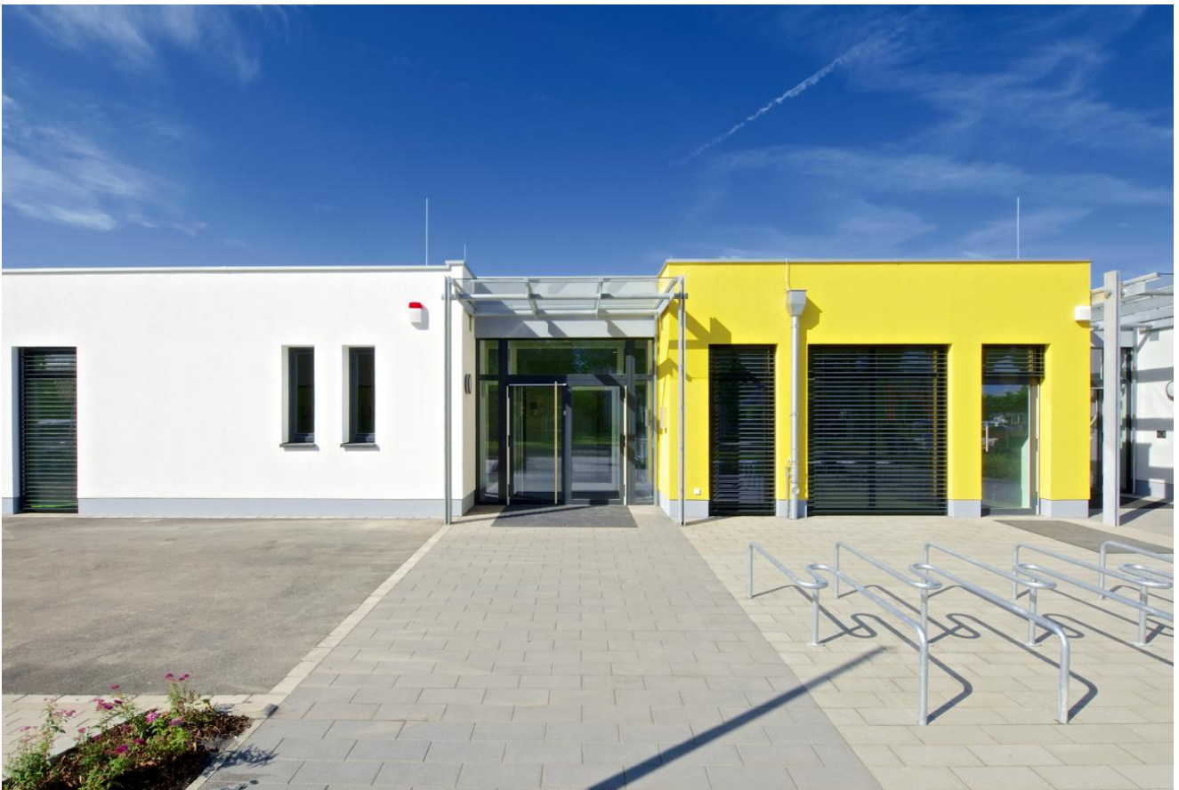
exterior view of the building, entrance