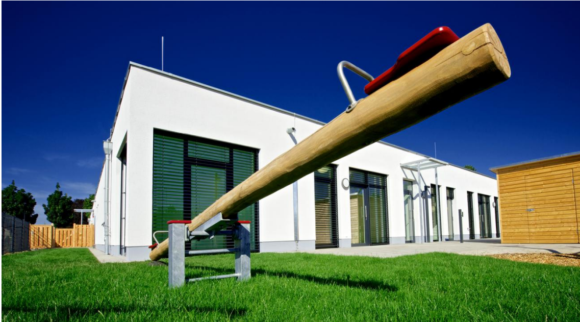
exterior view of the building